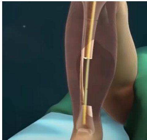
Figure 2: Fractured bones removed, and intramedullary rods inserted

Once the rod is inserted, the mechanism of ilizarov clickers starts dragging down the bone and new bone will be generated in the orthogonal cut.