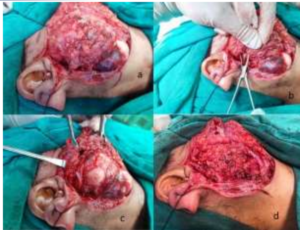
Figure no 2. a)Image showing swelling of parotid gland after elevating SMAS flap. b) localization of facial nerve trunk. c) after elevating superficial lobe and retracting facial nerve, tumour involving deep lobe is visible. d) excision of superficial lobe and deep lobe tumour. Facial nerve branching pattern is visible.