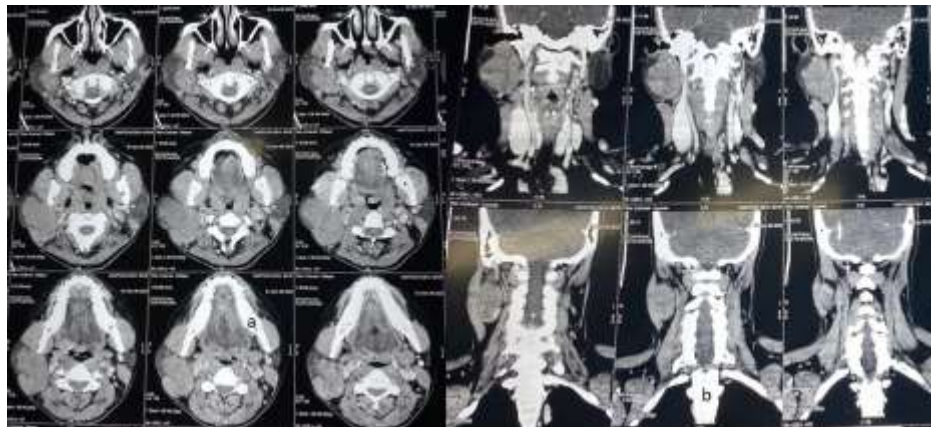
Figure no 1. CECT [a (axial ) & b (coronal) cuts] showing heterogeneously enhancing iso- to a mildly hyperdense lesion in the right parotid gland involving superficial and deep lobes and the swelling is confined within the gland capsule.

On local examination, there was an external swelling around 6 x 5 cm in size extending from just in front of the tragus up to 1 cm below the angle of the mandible inferiorly and from the anterior border of sternocleidomastoid muscle posteriorly to 2 cm in front of angle of mandible over the mandibular ramus anteriorly. Facial symmetry was present and facial nerve examination was normal. On palpation, the swelling was firm in consistency, non-tender, mobile and non-fluctuant. Intraoral examination was normal. Bilateral level II lymph nodes were palpable. Fine needle aspiration cytology revealed pleomorphic adenoma of the right parotid gland. Contrast-enhanced CT of the neck revealed approximately 59 (AP) x 36 (TR) x 55 (CC) mm sized heterogeneously enhancing iso- to mildly hyperdense space-occupying lesion in right parotid gland involving superficial as well as deep lobe likely suggestive of pleomorphic adenoma. The lesion was confined within the gland capsule with no extra glandular extension ( Figure no 1 ).