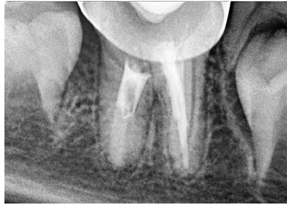
Figure 10. Follow-up radiograph after 12 months, the periapical lesion fully healed.