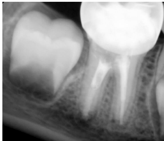
Figure 8. Follow-up radiograph after 3 months, the periapical lesion around the distal root began to resolve.