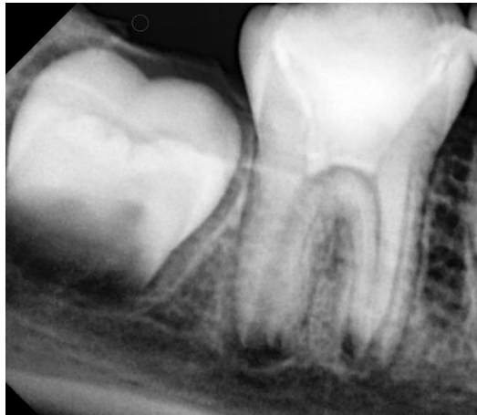
Figure 1. Diagnostic radiograph of the right permanent mandibular first molar showed the presence of periapical radiolucency with lamina dura widening.

(Quatrocin, ALFARES Pharmaceuticals Co., Damascus, Syria) in a concentration of 1mg/mL, mixed with propylene glycol into a creamy paste using lentulo spiral (Dentsply, Maillefer, Ballaigues, Switzerland). The access cavity was sealed with temporary restoration (Cavit, 3M ESPE, St. Paul, MN, USA).