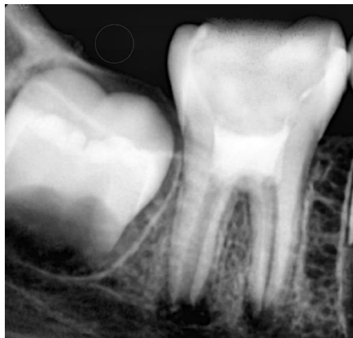
Figure 3. Postoperative radiograph after regenerative treatment and MTA placement.