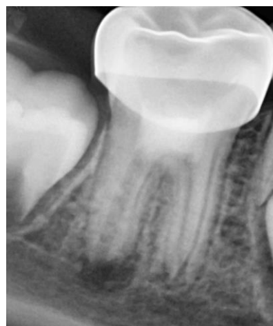
Figure 4. Follow-up radiograph after 9 months showed a periapical lesion around the distal root and bony healing around the mesial roots.