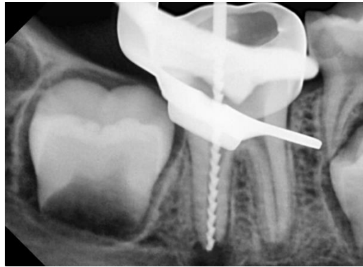
Figure 5. Working length determination in the distal canal

A conventional IANB was administered. After the removal of the stainless steel crown, the tooth was isolated with a rubber dam. The 2 mm thick layer of white MTA was removed with CPR ultrasonic tips (Obtura Spartan Endodontics, Algonquin, IL, USA). After WL determination ( Figure 5 ), the distal root was slightly shaped with stainless steel K-file (Dentsply, Maillefer, Ballaigues, Switzerland), and the mesial roots were