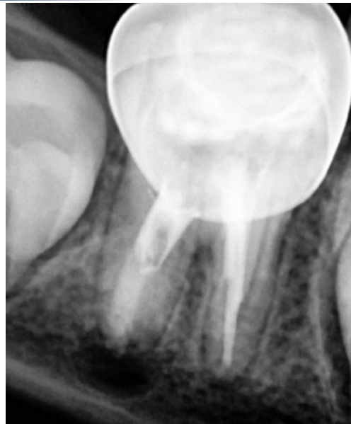
Figure 7. Postoperative radiograph after MTA apical plug placement and sealing with bioceramic-based root canal sealer.