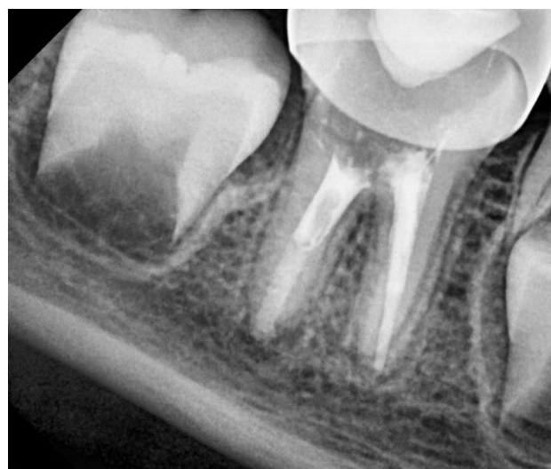
Figure 9. Follow-up radiograph after 6 months, the periapical lesion has resolved.