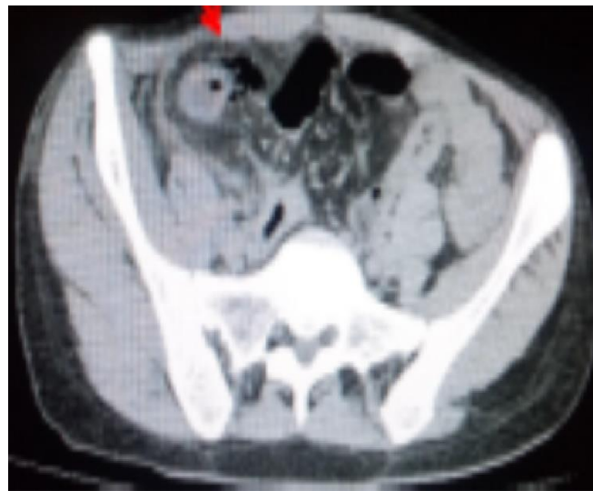
Figure1: Computed tomography section showing extra-digestive air bubbles opposite the last ileal loop (red arrow)

A body computed tomography was performed, revealing circumferential parietal thickening of the last ileal loop, measuring 10 mm and extending over 30 cm, with arterial enhancement and parietal loss of substance of an ileal loop estimated at 02 cm in extent, located 10 cm from the ileo-caecal junction, with multiple air bubbles and fluid opacities. This was associated with infiltration of mesenteric fat. The imager concluded that the peritonitis was due to perforation of the last ileal loop in Crohn's disease ( figures 1 and 2 ).